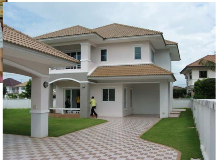
Our house in Khonkaen, Thailand.